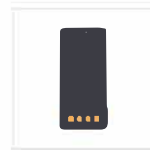
2000mAh Li-polymer Battery