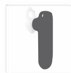
BT Wireless earpiece