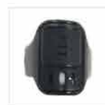
BT wireless ring PTT