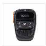
BT Wireless remote speaker microphone